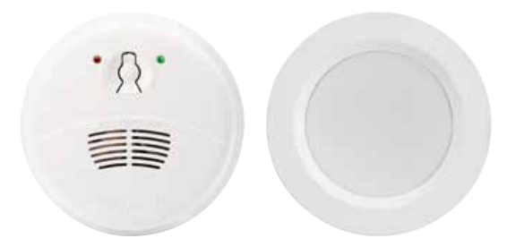
Same size as a low-voltage downlight fitting.