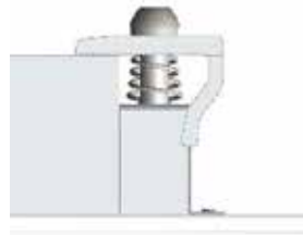
Used as End Clamp