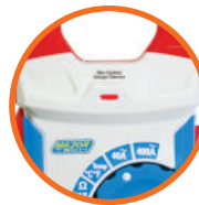
Red Light indicates detection of Non Contact Voltage (NCV)