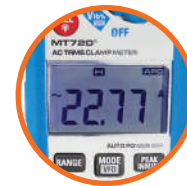
4000 Count Backlit LCD Display