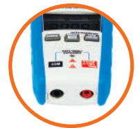
Rear entry of standard 4mm Test Lead Terminals