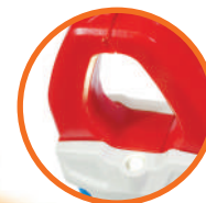
Meter includes flash light to light up area of test