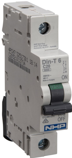
Representative Photo Only (actual product may vary based on configuration selections)