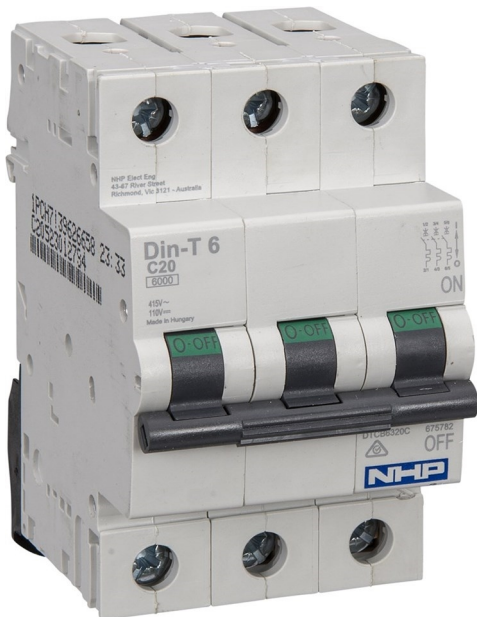
Representative Photo Only (actual product may vary based on configuration selections)