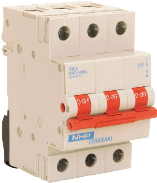
MOD6 main switch, DIN rail, 3P, 100A

Representative Photo Only (actual product may vary based on configuration selections)