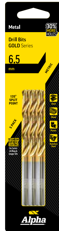
5 PACK Sizes 5 - 6.5mm