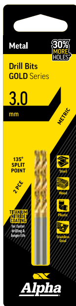
2 PCE GOLD & SILVER Sizes 1.0 - 3.0mm