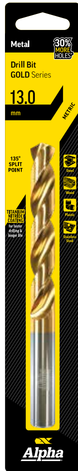
1 PCE: GOLD & SILVER Sizes 3.2 - 13.0mm 1 PCE: COBALT All sizes

CARDED TRADE PACKS Supplied in hangable card