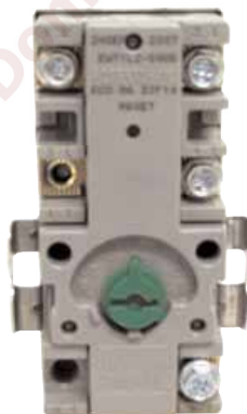
Old EWT series (Grey Body)