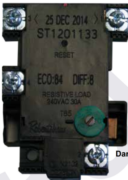
Dark Green Dial