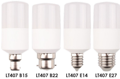
LT407 B15 LT407 B22 LT407 E14 LT407 E27